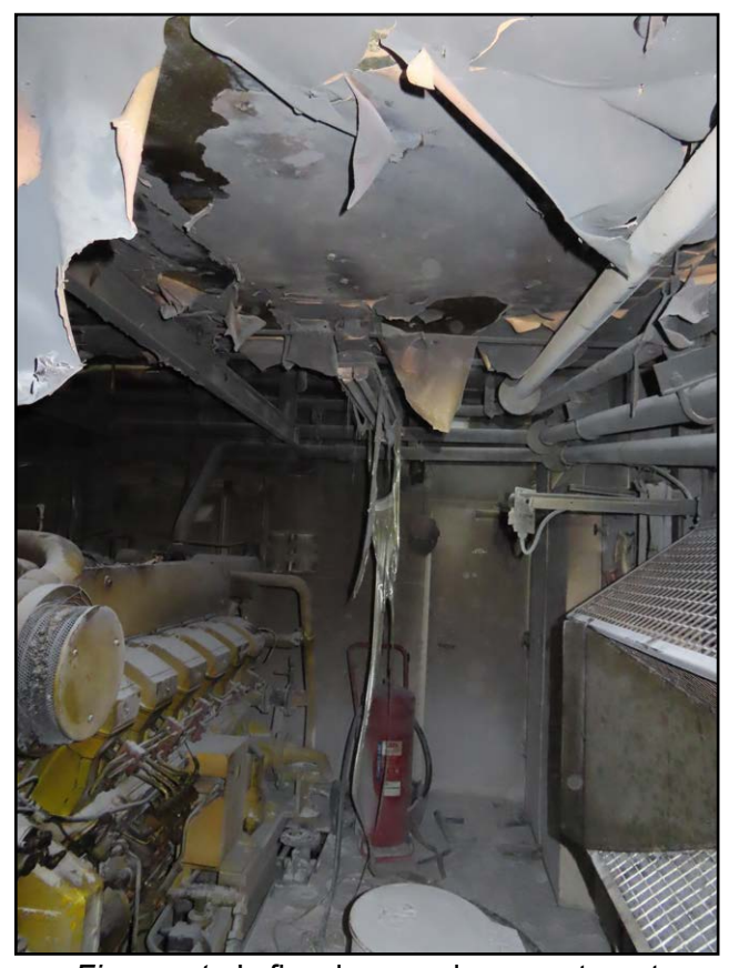
Finnmaster's fire-damaged compartment