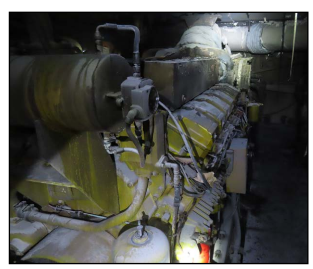
Figure 1: Damage sustained to auxiliary engine room

Finnmaster's auxiliary engine room was equipped with two main alternators. These were driven by marine gas oil (MGO) fuelled engines and named as auxiliary engine 1 (AE1) and auxiliary engine 2 (AE2). Each auxiliary engine comprised 12 cylinders in a v-shaped configuration and was rated at 1100 kilowatts.