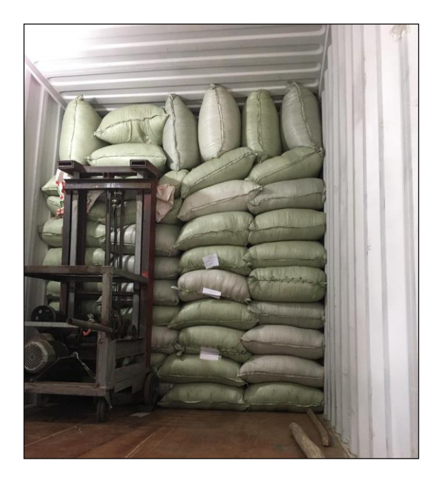
Figure 7: Indication of how the cinnamon leaves in bags were stowed inside the container

Figure 7 gives an indication of how the cinnamon leaves in bags were packed and stowed inside the container.