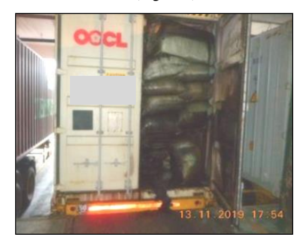
Figure 5: Right rear door open, showing burnt bags

right side of the door was opened, a very strong/pungent smell of burnt cinnamon leaves was noticed (Figure 5).