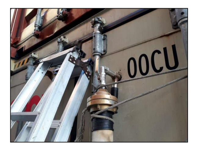
Figure 3: Water mist lance inserted in container and secured with rope

As a precaution, the container was flooded with a continuous flow of water until 0755 of the next day. During this time, the container was also kept under continuous supervision. Temperature readings were taken again at 0830, which gave the following readings: top 27 °C, middle 27 °C and bottom 28 °C.