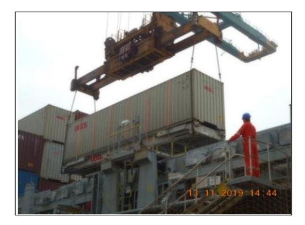
Figure 4: The fire-stricken container being discharged in Singapore

On 13 November 2019, the container was unloaded at Singapore (Figure 4).