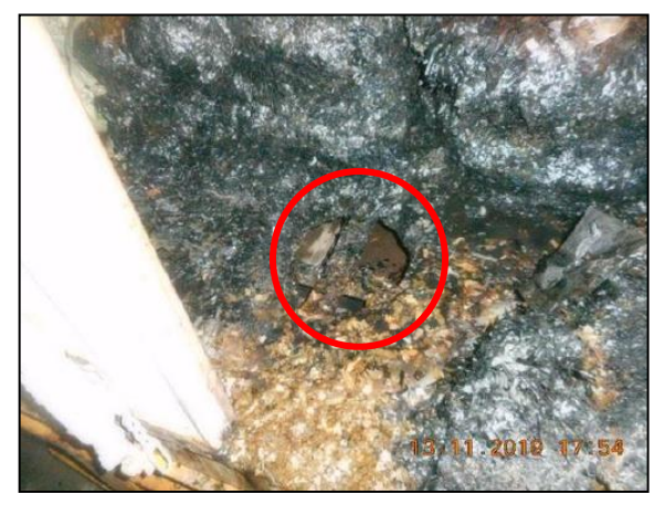
Figure 6: Hole located on the container's bottom

Several bags on the bottom stow, located near the rear doorway, were noted to be missing. Additionally, a hole (approximately 200 mm in diameter) was observed on the bottom wooden floorboard. The location of this hole was above the first bottom crossmember, located approximately 500 mm length-wise into the container from the rear end (Figure 6).