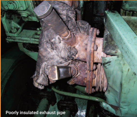
Poorly insulated exhaust pipe

condition. "Over time, however, when overhauling engine room machinery and removing/refitting exhaust pipes, the insulation will deteriorate," explains Stålberg. "An exhaust pipe system insulated to 95% is not good enough – it must be 100% intact – always."